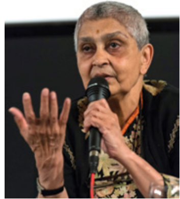
Gayatri Chakravorty Spivak

Pefkios Georgiades Amphitheatre, Cyprus University of Technology, Limassol