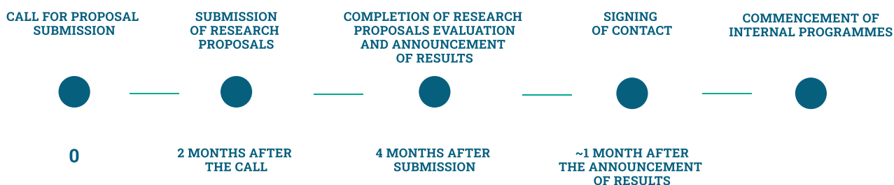
Outline: Indicative Timetable for the Call, Submission and Evaluation of the Research Proposals and the commencement of the Internal Programmes.